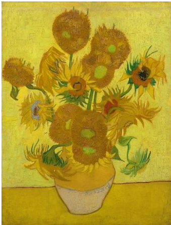
(Vincent) Van Gogh